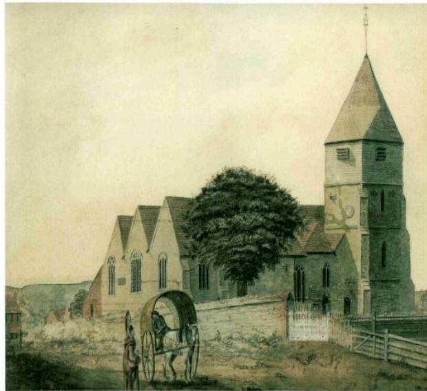
Lynsted church 1790